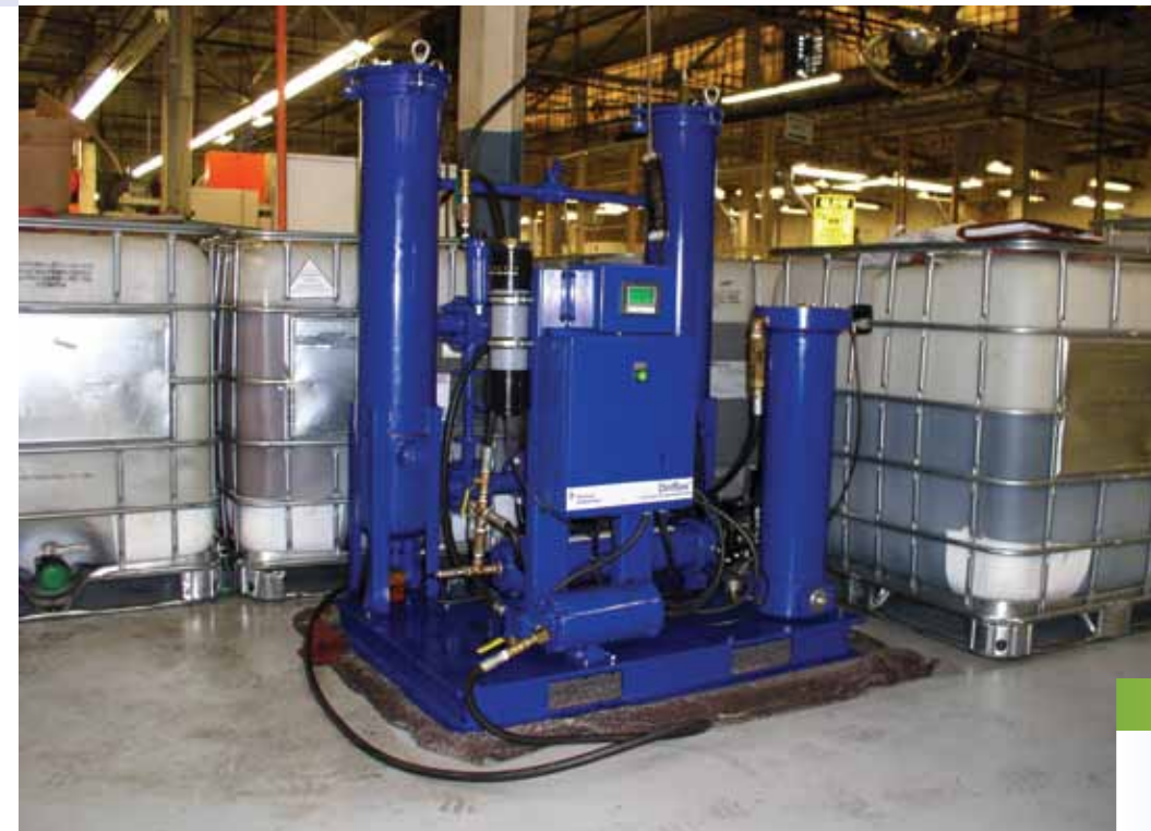
Pentair Industrial Driflex™ Oil Conditioning System at Smith & Wesson®